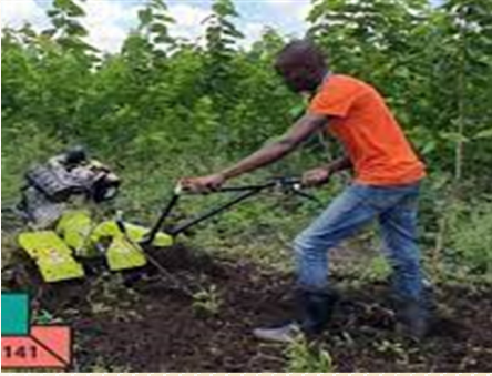
Mechanization encourages greater youth involvement