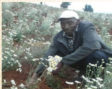
Land in pyrethrum growing regions in Kenya is owned by the elderly