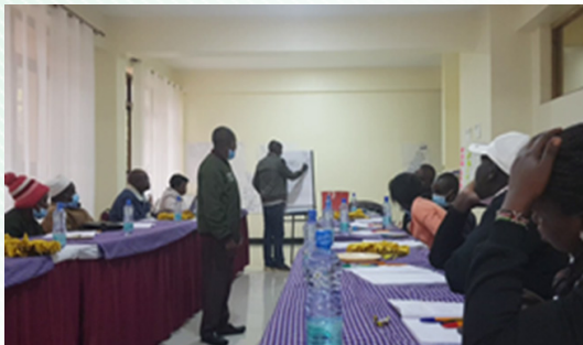
Capacity building is important for youth