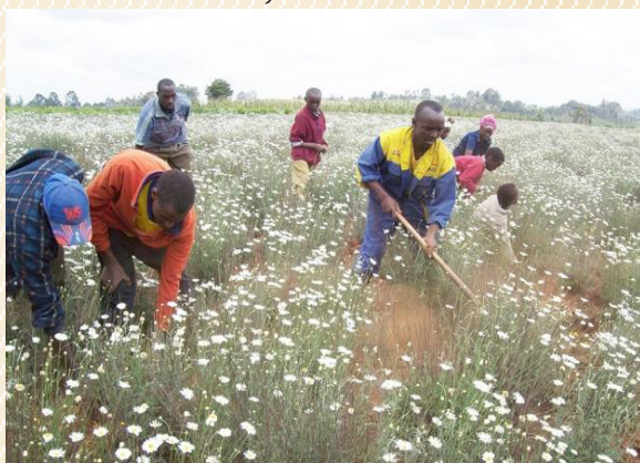
Pyrethrum farming involves a lot of manual work, which is often unattractive to the youth