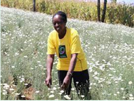
Increased youth involvement