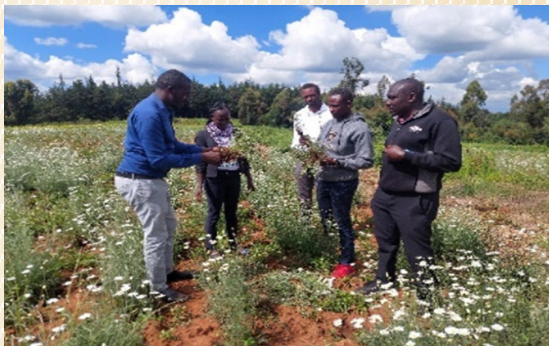
Youth will be equipped with skills of pyrethrum value chain