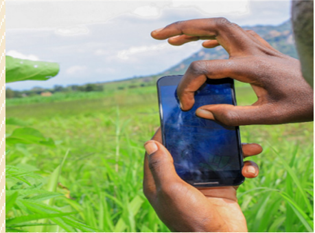
Mechanization encourages greater youth involvement