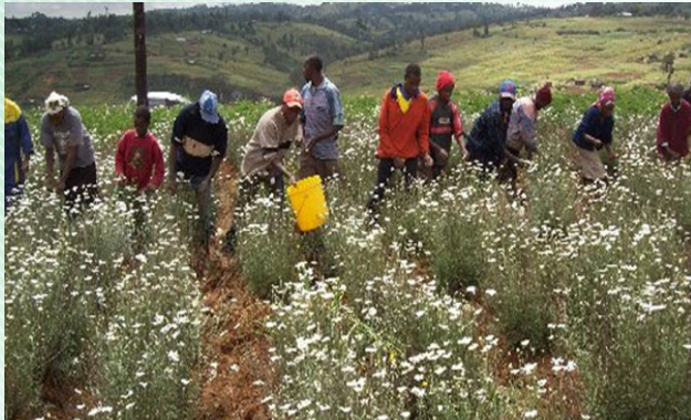
Youth involvement will increase digitization pyrethrum