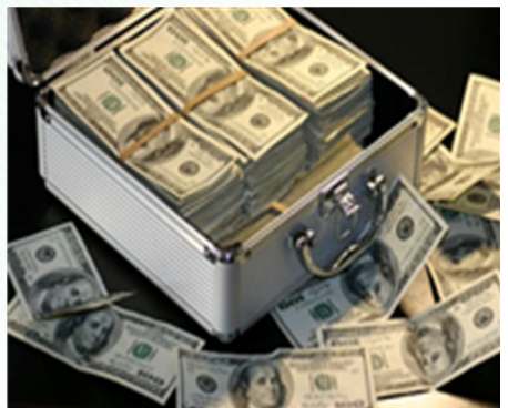
Youth involvement will lead to increased income from the sale of produce